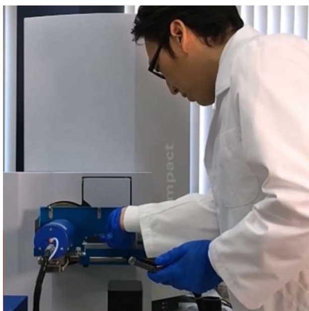
Caption: Introducing polymer sample into ionRocket temperature gradient sample introduction device for DART ® -MS

Illustrative images: (available on request)