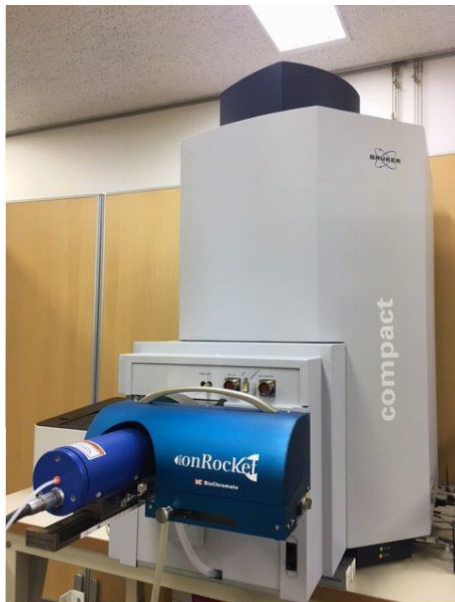
Caption: an example of an ionRocket DART®-MS system

Illustrative images: (available on request)