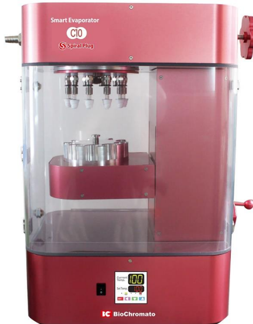
Caption: Smart Evaporator C10 (available in 4 attractive colours)

Illustrative images: (available on request)